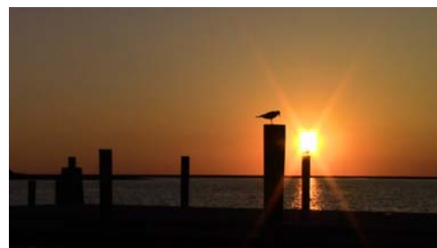
Sunset from the dock during the June Crisfield mission trip.