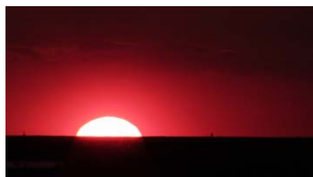
Sunrise in Crisfield

Thanks to you and others like you who give so generously to support our work of equipping global leaders. Africa University has come a very long way in a relatively short period of time. Together, we've built an effective and relevant world-class institution. We've educated young people from 29 African countries and sent them back home to serve. Across the African continent, they are making a difference as agriculturalists, nurses, teachers, pastors, peace-builders, and managers of public and private enterprises.