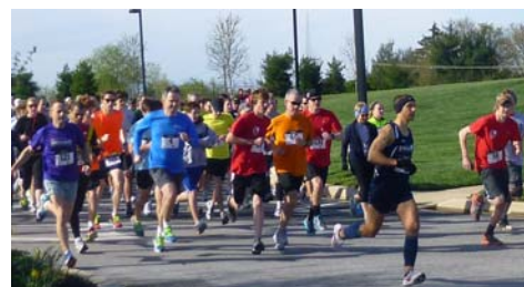
Participants at 2013 Family 5K Run/Walk take off from the traffic circle.

Last year's Glen Mar 5K, held in April, attracted 165 participants. It raised $4,000 and 400 pounds of food for the Howard County Food Bank.