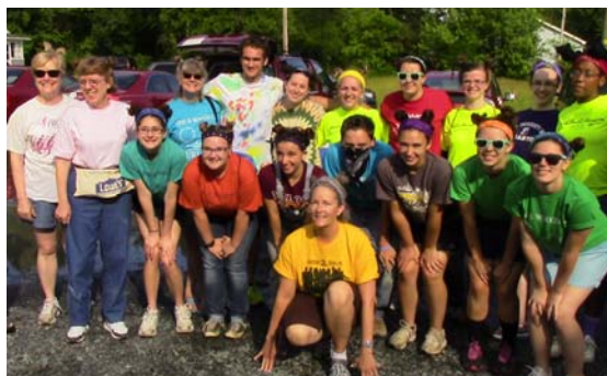
Glen Mar Crisfield mis- sion team

The Glen Mar UMC mission group was ‘thankful for